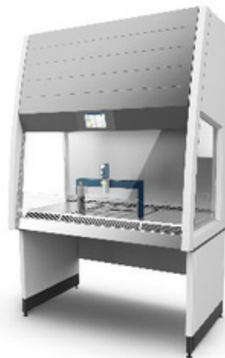
Figure 2: claire® lh safety cabinet

A laptop connected to the claire® lh can control the methods so that no programming knowledge is required. The software takes over the control and carries out defined processes automatically. The LHS automatically logs the processes and checks them for inconsistencies. Compared to manual pipetting, the use of the LHS achieves a time saving of 70%.